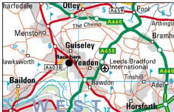
Getting to Guiseley

Turn left onto Haworth Lane opposite 'Tut & Shive pub', then take the first left turning into Dragons car park. Dragons Health club, Haworth lane, Yeadon.